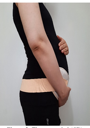
Figure 2: The current belt(CB)

The lumbar part of the new belt covers the lumbar region from below the scapula to the gluteal area, providing support along the entire lumbar region. The abdominal component is positioned inside the abdomen to support the weight of the fetus specifically. The pelvic part is placed around the pelvic girdle (PG) and includes a coccygeal pad for additional support and comfort. Shoulder straps