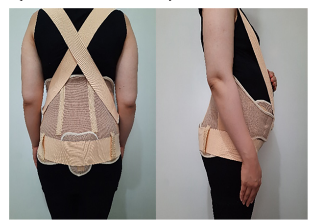
Figure 3: The new pregnancy belt

The researchers used the 36-item Short Form Survey (SF-36) questionnaire to assess the Quality of Life (QOL) of pregnant females in this study [28]. SF-36 is a self-reported health measure widely used to measure various