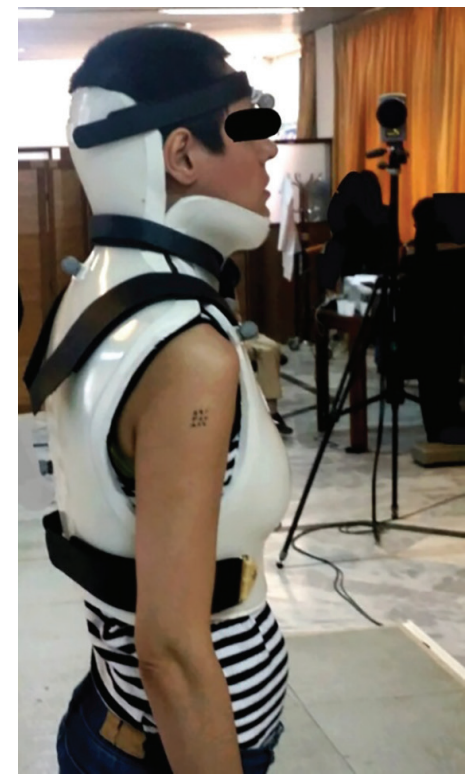
Figure 1: The Minerva cervical collar used in this study.

A motion analysis system with 7 high speed cameras was used to record the motions of the upper cervical region (occiput), thoracic and cervicothoracic regions. Some reflective markers were attached on the occiput, spinous process of T12 and spinous process of C7. These markers settled on the orthoses with due attention given to the anatomical landmarks of every participant. The flexion/extension, axial rotation, and lateral bending ranges of motion were evaluated in this study. The time