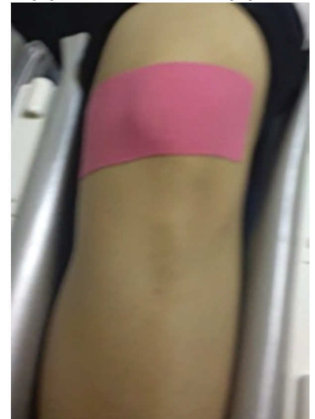
Figure 1: Patellar taping

The subjects lay in a supine position and a trained examiner applied goniometer to fix patient knee joint in 30° flexion passively; the other leg was positioned alongside the magnets. The patellofemoral joint of the test leg was imaged in this position. A second scan was performed after taping the knee by applying the medial glide technique (taping from lateral to medial border of the patella. Figure 1 showed immediately after first imaging to assess short term effects of taping.