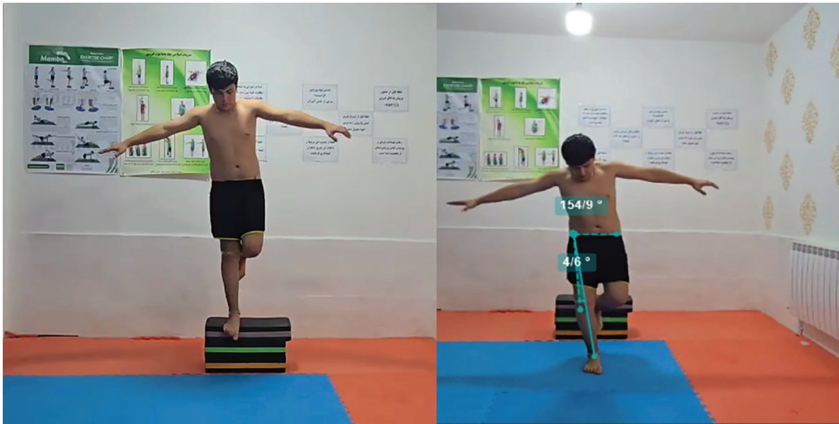
Figure 2: Measurement of the knee valgus angle