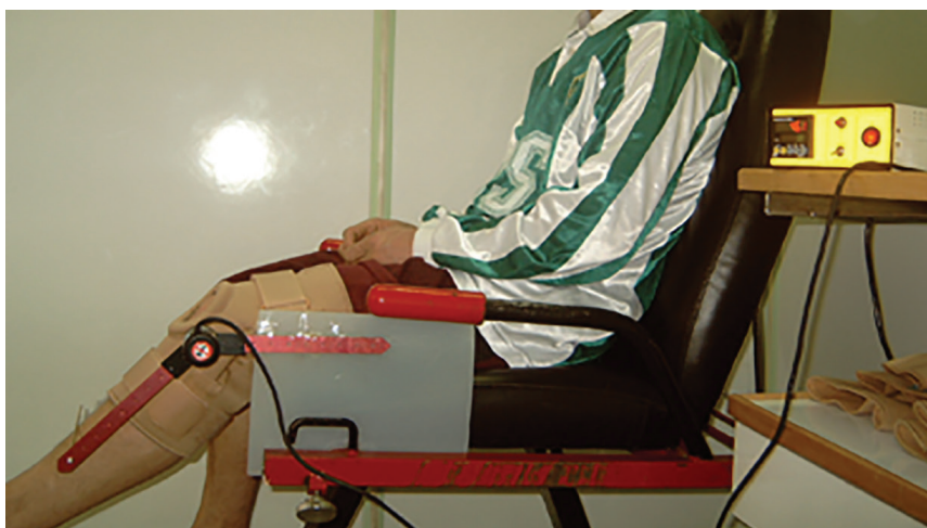
Figure 2: The setting of testing table

Knee JPS accuracy was calculated using absolute angle replication error in 30^\circ , 45^\circ and 60^\circ of knee flexion [18]. Absolute error was considered as deviation rate from the