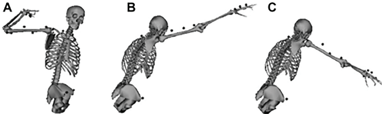
Figure 2: Sagittal view of full-cock (A), ball-release (B), and zero elbow velocity (C) events used to define the release (A to B) and breaking (B to C) phases of an overhead seated thro.

The demographic data of the subjects are presented in Table 1. The results of independent sample t-test did not show any significant differences in the variables of age, height, weight, and BMI between the groups. The results K-S test revealed that the data distribution was normal for both groups as well as for the arm abduction and its internal and external rotation.