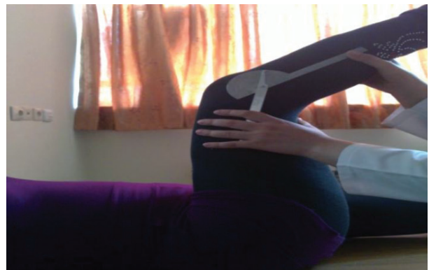
Figure 1: The measurement of hamstring flexibility.

To measure hamstring flexibility, passive knee extension tests were done in the supine position, as follows. The pelvis was immobilized, and the leg to be measured was positioned in 90-90 degree hip and knee flexion. Then one examiner extended the knee joint passively to the point where she felt resistance to movement. A second examiner placed the center (fulcrum) of a universal goniometer on the lateral femoral condyle with the stationary arm of the goniometer aligned on the lateral malleolus and the moving arm aligned with the greater trochanter, and recorded the angle as shown in figure 1 [27-32]. All measurements performed by the same examiner.