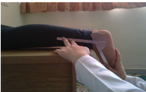
Figure 4: The evaluation of gastrocnemius flexibility.

As shown in figure 4, to evaluate gastrocnemius flexibility the participant was asked to lie prone with her knee extended and the foot hanging from the end of the plinth. Passive ankle dorsiflexion was done until resistance was felt. The center of the goniometer was placed on the lateral malleolus, and the stationary arm was aligned with the leg while the moving arm was positioned on the lateral side of foot [35].