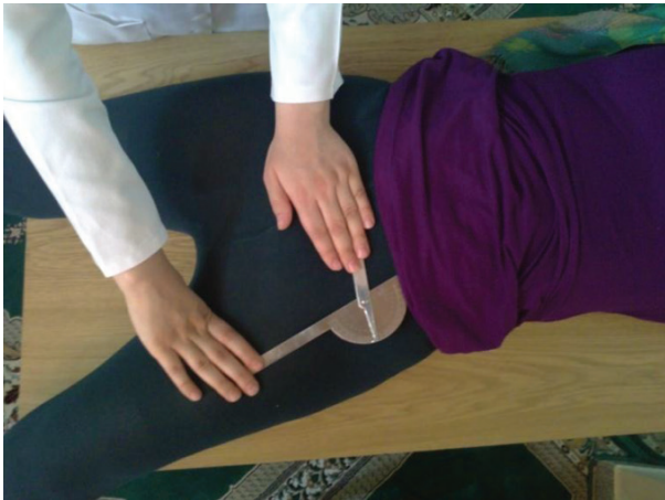
Figure 3: The measurement of adductor flexibility.

As shown in figure 4, to evaluate gastrocnemius flexibility the participant was asked to lie prone with her knee extended and the foot hanging from the end of the plinth. Passive ankle dorsiflexion was done until resistance was felt. The center of the goniometer was placed on the lateral malleolus, and the stationary arm was aligned with the leg while the moving arm was positioned on the lateral side of foot [35].