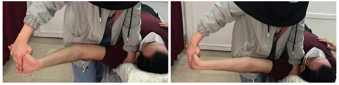
Figure 6: One-ended proximal tensioner mobilization.