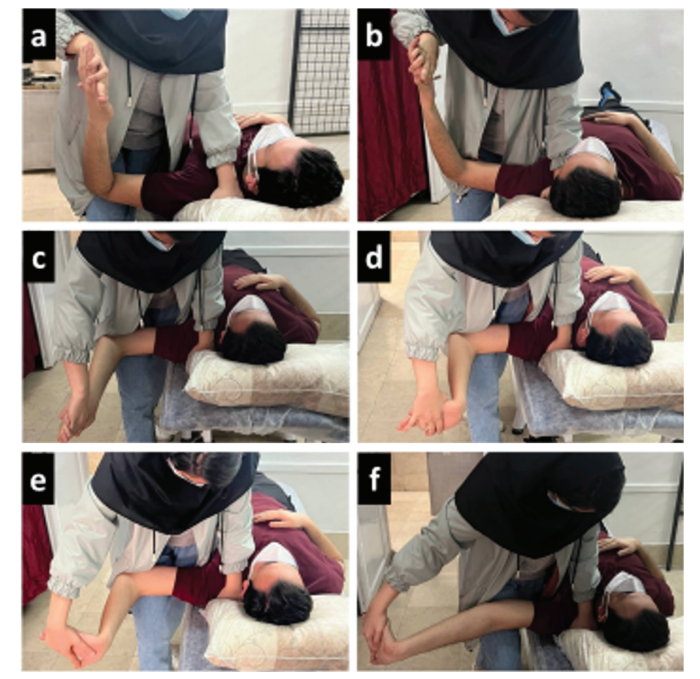
Figure 3: Median neurodynamic techniques sequence, a) Starting position b) Arm abduction c) Arm external rotation d) Forearm supination e) Wrist and fingers extension f) Elbow extension.

All participants will receive education on activity modification in the first session, including: 1) Reducing the duration, repetition, and force during activities of daily living (ADL). 2) Avoiding activities that require prolonged