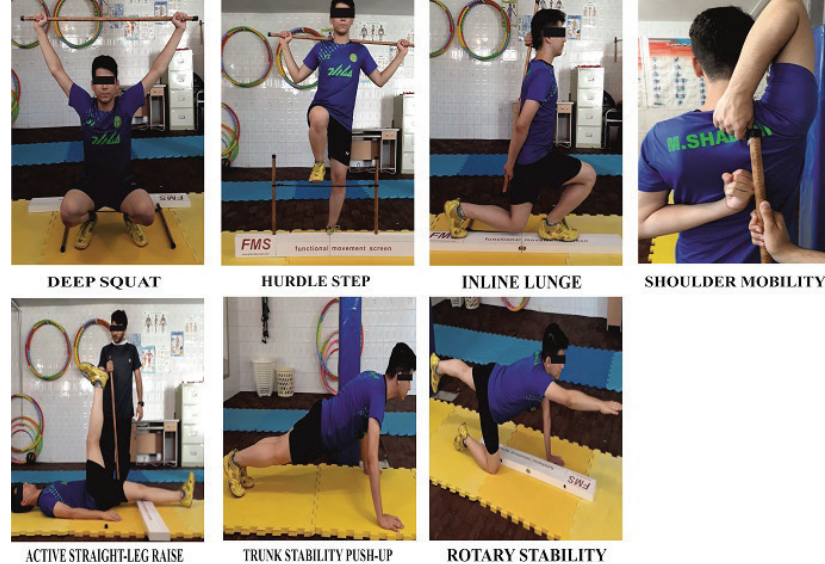
Figure 1: FMS Test

Data related to the subjects' characteristics including age, weight, and height in addition to the research variables were analyzed using SPSS software version 23 (Table 2). Considering the normality of data and using the Shapiro-Wilk test, the analysis of variance (ANOVA) with repeated measures was performed for investigating