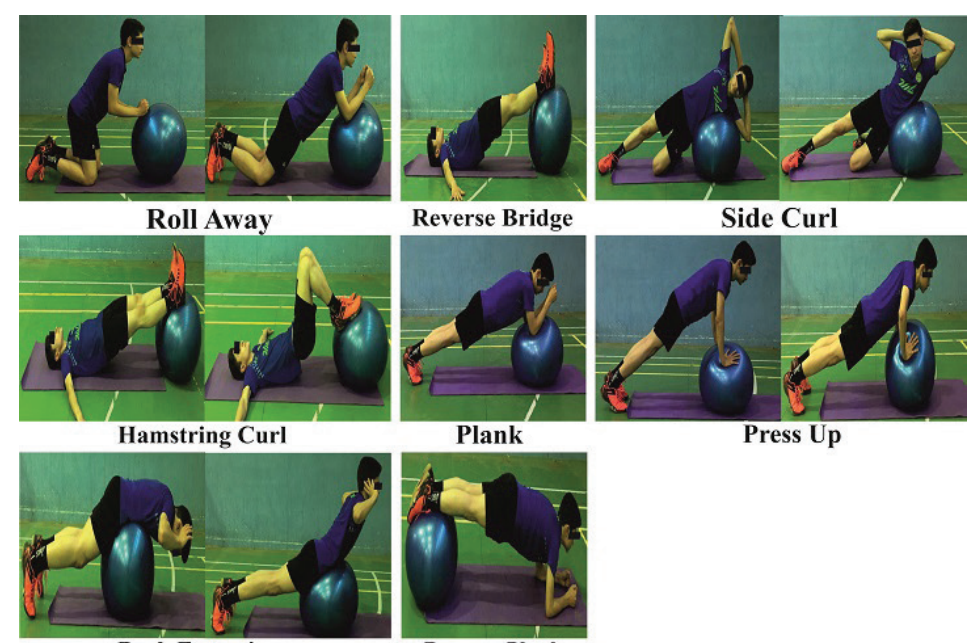
Back Extension Reverse Plank Figure 2: Exercise protocol with Swiss ball

the variables among the research groups. In addition, the significance level was set at P < 0.05.