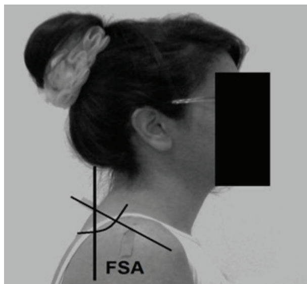
Figure 1: Forward shoulder angle