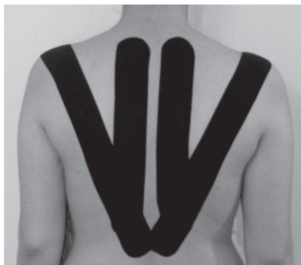
Figure 2: Scapular kinesiotaping

and with one session in a day [2, 14]. To ensure proper performance of exercise, the first and fourth exercise session were observed by examiner. Also, a daily exercise chart was given to subjects and they were asked to mark each daily exercise on it. Stretch group performed home stretching exercise bilaterally for two weeks. For combined group, in addition of stretching exercise, kinesiotape was used. Kinesiotape was applied with mechanical correction technique with 50-100% tension [15]. Initially the amount of tension was 50% and ultimately achieved 100% in the end of treatment sessions. After preparing kinesiotape with appropriate length, the subjects were asked to flatten their back (thoracic extension). Vertical Kinesiotape was applied on either sides of the spine from first thoracic spine ( T_1 ) to twelfth thoracic spine ( T_{12} ). Then the subject fully depressed and retracted shoulders and an oblique Kinesiotape was applied from acromion to T_{12} spinous process bilaterally [4, 16-18] (Figure 2). kinesiotape was replaced every three days In treatment period.