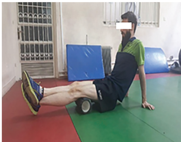
Figure 1: Starting point from the top of the Ischial Tuberosity