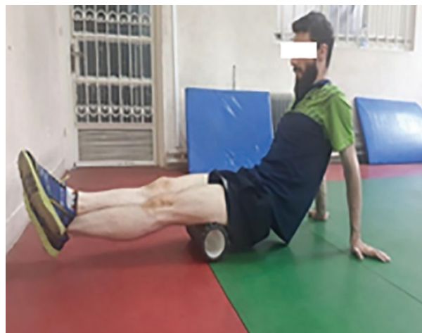
Figure 2: End of movement to popliteal fossa

a foam roller. After an 8-week intervention period, joint position sense and dynamic balance were re-measured for each group. Twenty-four collegiate athletes with hamstring shortness as well as anthropometric characteristics reported in Table 1 were selected and evaluated.