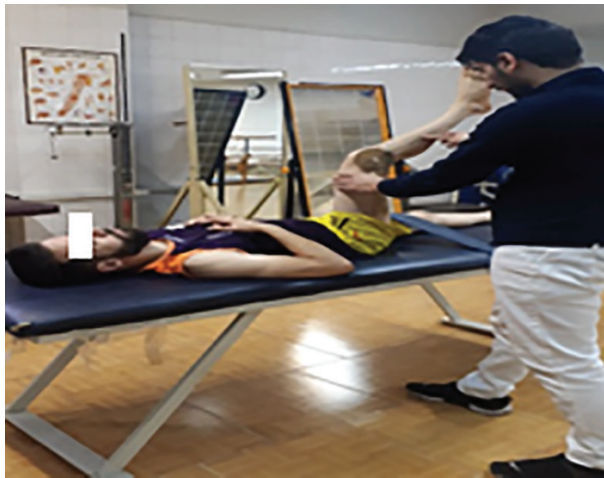
Figure 3: Active Knee Extension test

The procedure is shown in Figure 3. Y dynamic balance test was used to measure balance in the present study [28]. The researchers reported excellent Interrater reliability (ICC=0.97- 0.99) and Intrarater (test-retest) reliability were moderate to excellent (ICC=0.68- 0.90) [28]. Also the results of the previous research indicated that the Y balance test is a valid measure (values 0.05-0.72) in the assessment of dynamic balance [29].