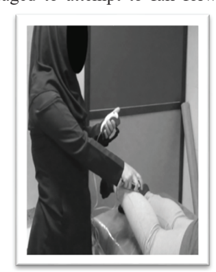
Figure 2: Some of the measuring the muscle strength