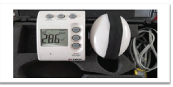
Figure 1: Handheld digital dynamometer

To assess the strength of the hip extensor muscles, participants were positioned on all fours, and the dynamometer was placed on the end of the femur. The strength of this muscle group was then measured.