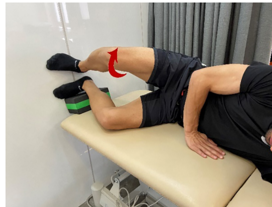
Figure 5: Left side lying right Gluteus Max activation with respiration