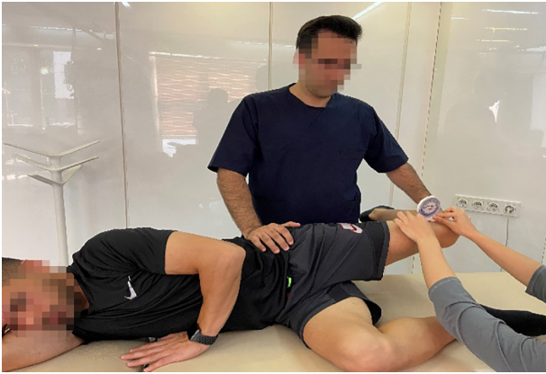
Figure 2: Measurement of hip adduction range of motion (ROM) using inclinometer