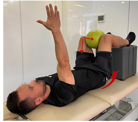
Figure 3: 90-90 Left hemibrIDGE with ball and respiration