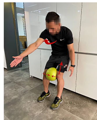
Figure 7: Wall supported squat with ball and respiration