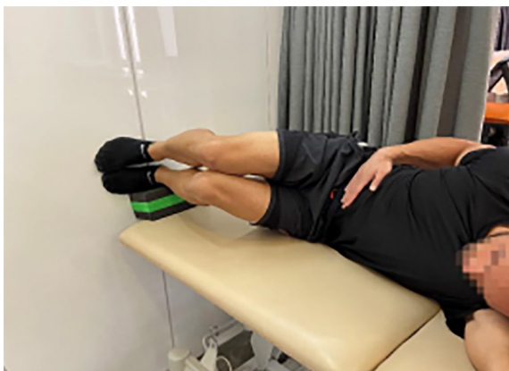
Figure 6: Left side lying knee to knee with respiration