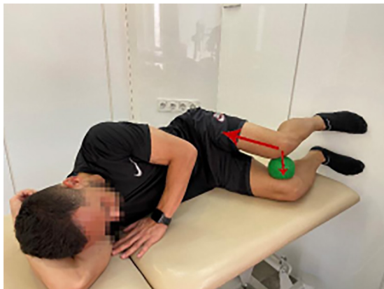
Figure 4: Right side lying left adductor pull back with respiration