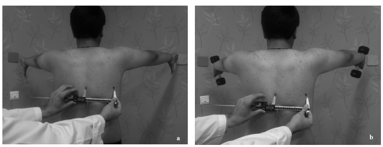
Figure 3: a) Unloaded scaption position, b) Loaded scaption position