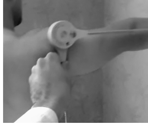
Figure 1: The Goniometry method for measuring 90 degrees of shoulder elevation

To measure the scaption angle, we set the fixed goniometer arm on the body axis in frontal plane, and we put the axis of goniometer on the acromion tip and