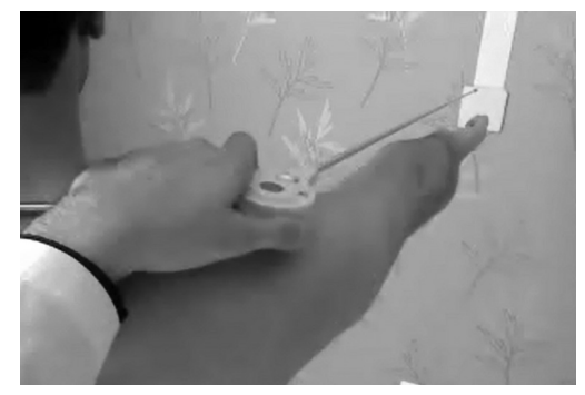
Figure 2: The Goniometry method for measuring 40 degrees of shoulder scaption

the mobile arm parallel to subject arm axis [8] (Figure 2). Since, there may be some differences in subject's upper extremity length, we extended the extendable mobile arm of goniometer up the wall and marked crossing points by markers on it. It is done in 90 degrees of scaption for both upper extremities separately. All subjects were asked to keep upper extremities compatible with that cross from a line with these markers. These markers were positioned on the wall in a way that they made 40 degrees with frontal body plane to guide subject along with scapula plane.