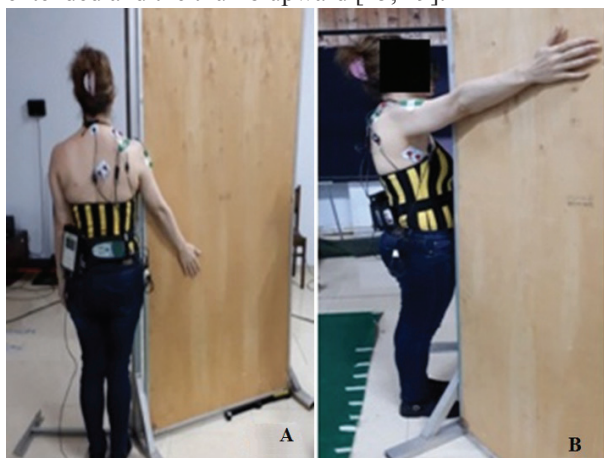
Figure 1: Abduction task procedure. A) The participant is standing next to the wooden plane; B) Abduction task around the scapular plane

The scapulothoracic muscles activity, which included the UT, LT, and SA, was recorded during shoulder abduction in the scapular plane (30° anterior to the frontal plane). The arm abduction test was performed within 2 seconds (concentric phase) and repeated three times with 30-second intervals between repetitions (Figure 1). The movement rhythm was controlled by a metronome with 60 beats per minute. The abduction was performed on a wooden plane in standing position with the elbow extended and the thumb upward [15, 19].