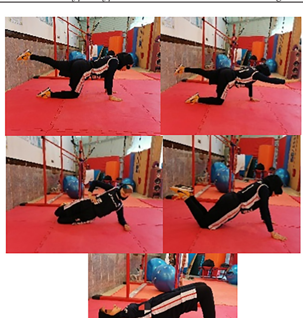
Figure 4: Core stability exercises (CSE)

Table 3. Domographic abaractoristics of participants