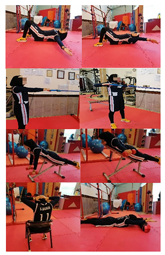
Figure 3: Functional corrective exercises (FCE)

of each exercise for the first two weeks and then added one set every two weeks reaching three sets at the fifth and sixth week.