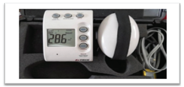
Figure 1: Handheld digital dynamometer

To assess the strength of the hip extensor muscles, participants were positioned on all fours, and the dynamometer was placed on the end of the femur. The strength of this muscle group was then measured.