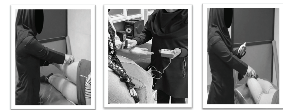
Figure 2: Some of the measuring the muscle strength

In the strength sub-test of the Bruininks-Oseretsky Test of Motor Proficiency, there were three components: the long jump test, the sit-up test, and the push-up test. Participants were directed to pull their arms back and leap forward as far as possible for the long jump test. They were encouraged to attempt to fall forward if balance