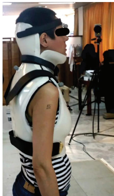
Figure 1: The Minerva cervical collar used in this study.

A motion analysis system with 7 high speed cameras was used to record the motions of the upper cervical region (occiput), thoracic and cervicothoracic regions. Some reflective markers were attached on the occiput, spinous process of T12 and spinous process of C7. These markers settled on the orthoses with due attention given to the anatomical landmarks of every participant. The flexion\extension, axial rotation, and lateral bending ranges of motion were evaluated in this study. The time